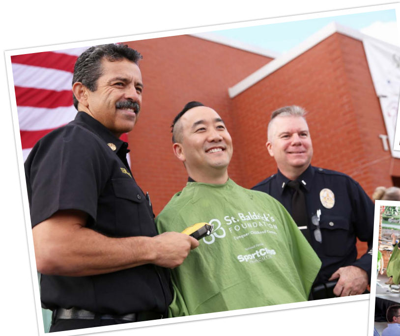
North Hollywood, CA